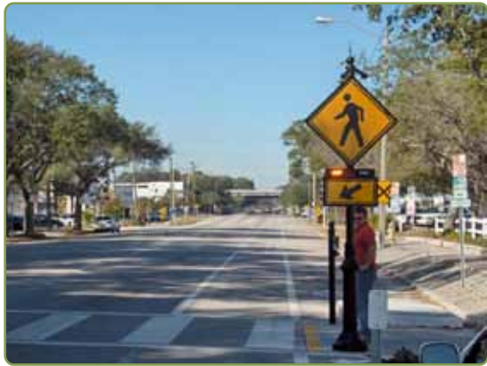
PEDESTRIAN ACTUATED CROSSWALK WITH RAPID FLASH LED BEACONS